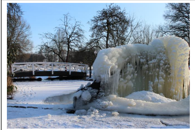
Winterbridge in Walsrode